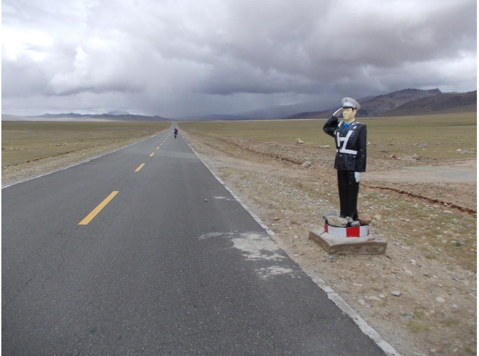
Nyalam – towards Mansarovar – Cycling...